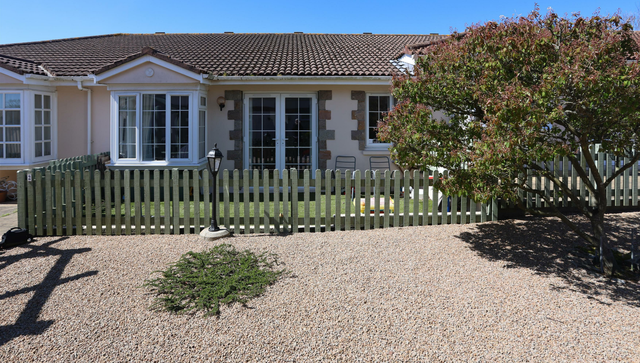
2 Allendale Court La Rue Du Becquet Vincent, Trinity, Jersey, JE3 5FL £579,000